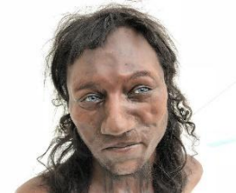
The Cheddar Man

Skara Brae is one of the best-preserved Neolithic settlements anywhere in Western Europe – which makes it a super-special find for archaeologists. The amazing artefacts discovered at this incredible site give us an insight into what life was like in Britain during that time.