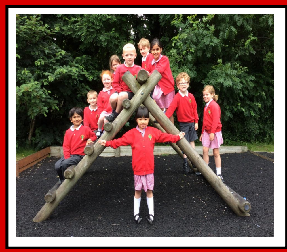
2022 – 2023 Believe, Grow, Succeed... ...to be the best ' me ' I can be.