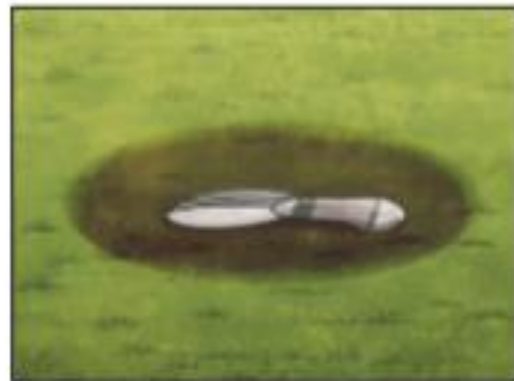
The mysterious metal objects and the circular shape burnt into the grass found on Greenville Primary School field.